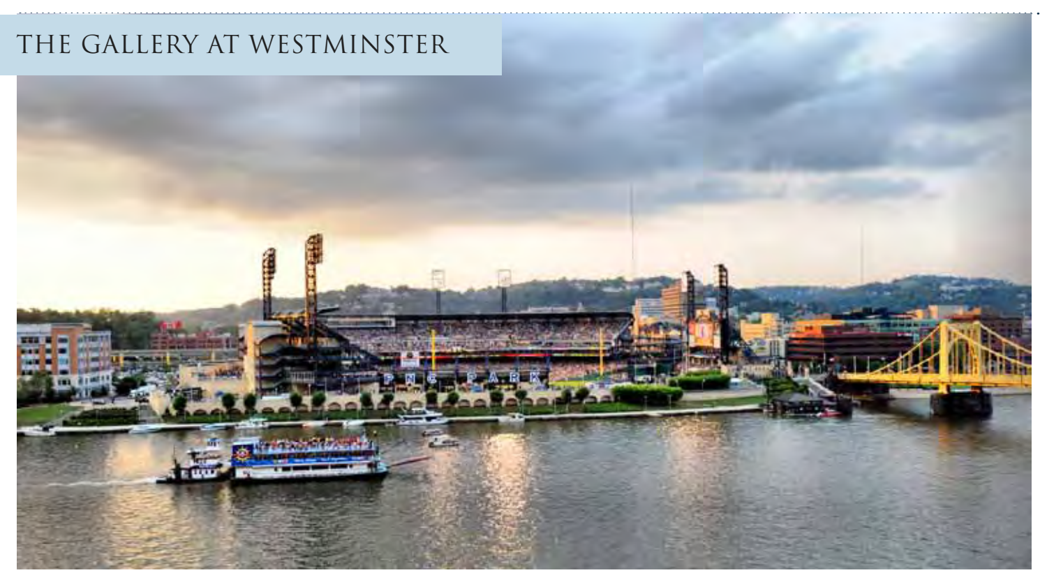
PNC Park