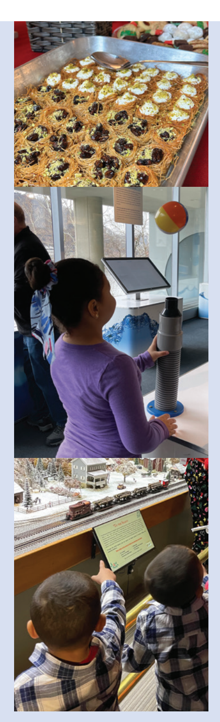
Top photo: Ab's baked dessert Middle and bottom photos: the kids enjoying the exhibits at the Carnegie Science Center