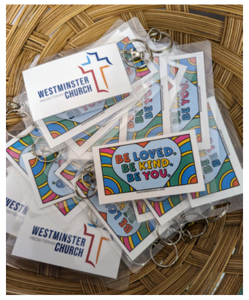
An abundance of Be Loved. Be Kind. Be You. tags for the taking.

from belonging to or being loved by our Creator. And we commit to doing our best to share God's love with those around us. Ephesians 4 gives instructions for unity in