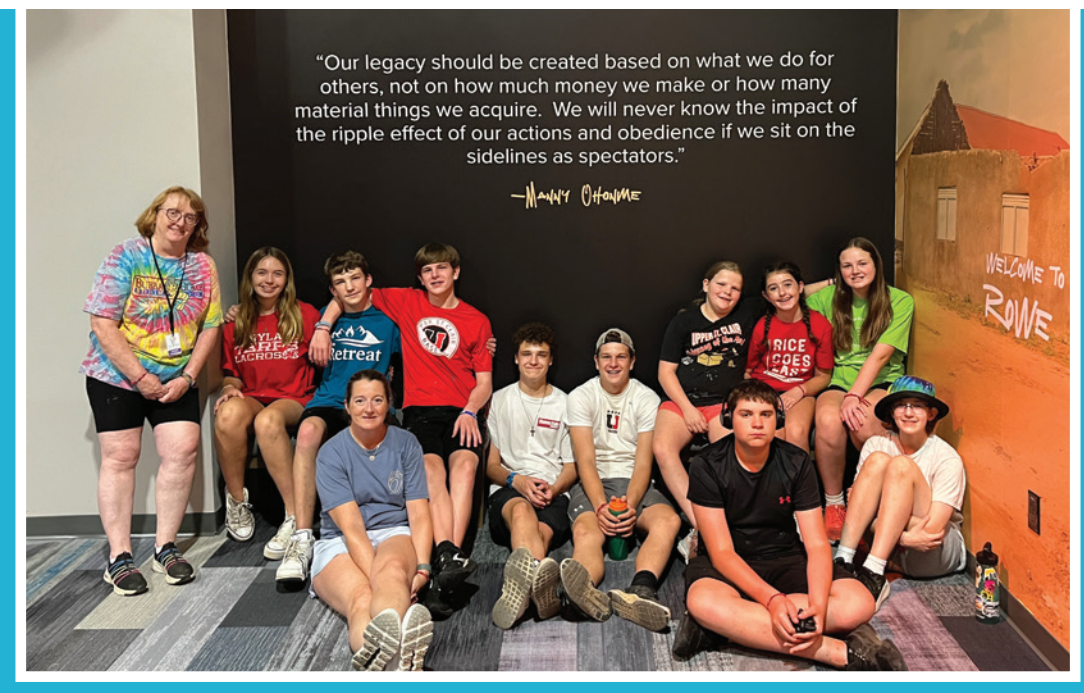
Youth group on a field trip to Rowe Park.