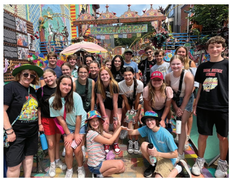
The Veritas youth group visits Randyland on the North Side.