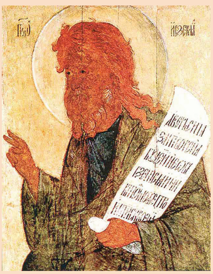
The Prophet Ezekiel, Russian Orthodox icon, 15th century