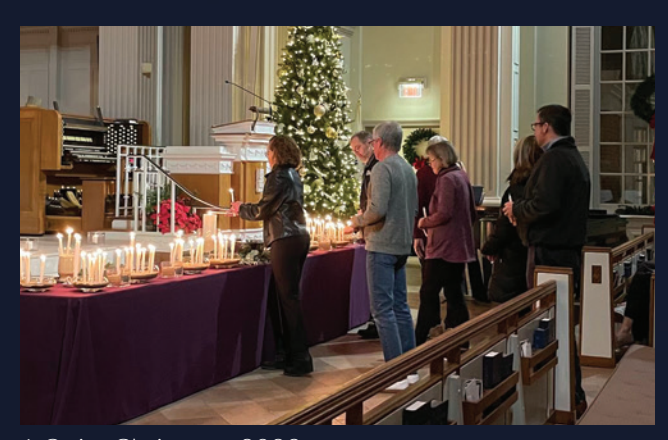
A Quiet Christmas, 2023.

When you think of Westminster what comes to mind? The music? The sanctuary? Vacation Bible School? For me it will forever be the embrace of an entire church community at a most unexpected time.