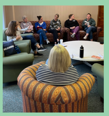
Women Belonging Retreat, November 2023

bout two years ago, I was restless. It was December 2021 and I had stepped away from church. Life felt hard, COVID was hard, personal things