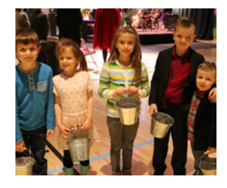
Pocket Change Project