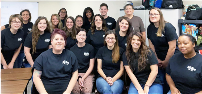
The Bair Foundation Pittsburgh office staff