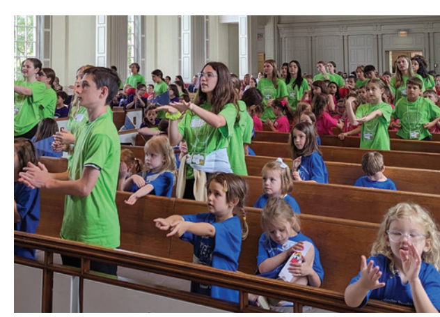
Barefoot Vacation Bible School

summer with a family bonfire night at Gilfillan Farm. In August, we enjoyed a pool party with plenty of swimming, pizza, conversation, and play. The Fall Festival returned in October where families from Westminster. WECEP, and the community came to enjoy crafts, games, and pumpkin picking. Of course the holiday season included two beloved Westminster events: Breakfast at the Manger and Family Gingerbread Night. Breakfast at the Manger was a lovely way to celebrate the Advent season and saw a huge jump in registrations compared to previous years. After a delicious pancake breakfast, JAM students acted out the Christmas story for those in attendance. Children then made crafts to celebrate the season as parents enjoyed fellowship together. Family Gingerbread Night hosted 30 families who expressed their creativity with icing, graham