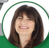
Ruth Reichl December 5, 2023