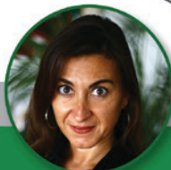
Lynsey Addario November 7, 2023