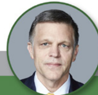
Douglas Brinkley April 9, 2024

All lectures begin at 10:00 a.m. at the Upper St Clair High School Theater. Please visit townhallsouth.org to purchase tickets.