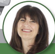
Ruth Reichl December 5, 2023