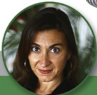
Lynsey Addario November 7, 2023